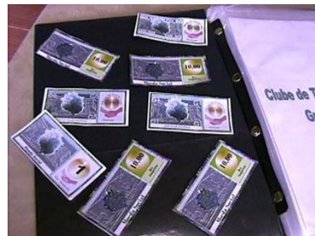
FEIRA DE TROCAS – GUAJUVIRAS (1)